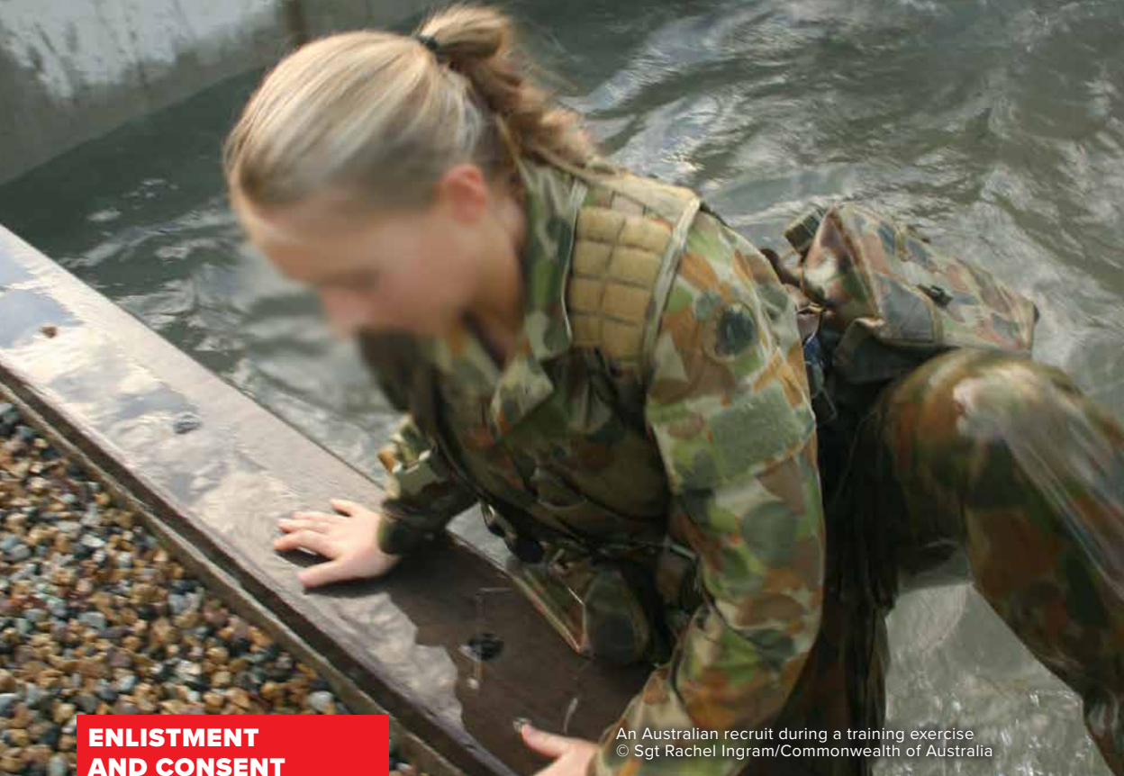
An Australian recruit during a training exercise