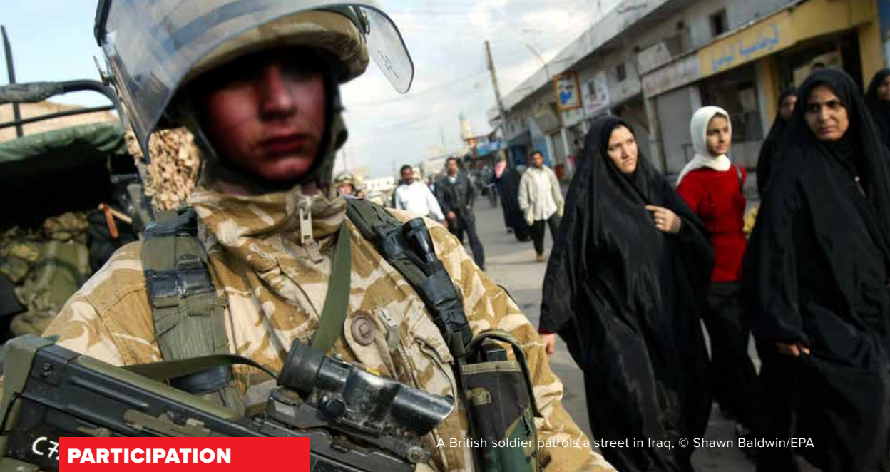
A British soldier patrols a street in Iraq