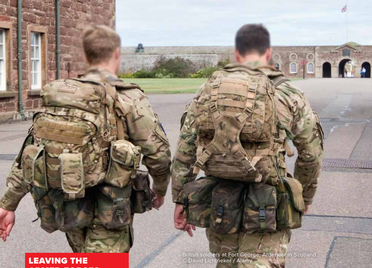
British soldiers at Fort George, Ardersier in Scotland