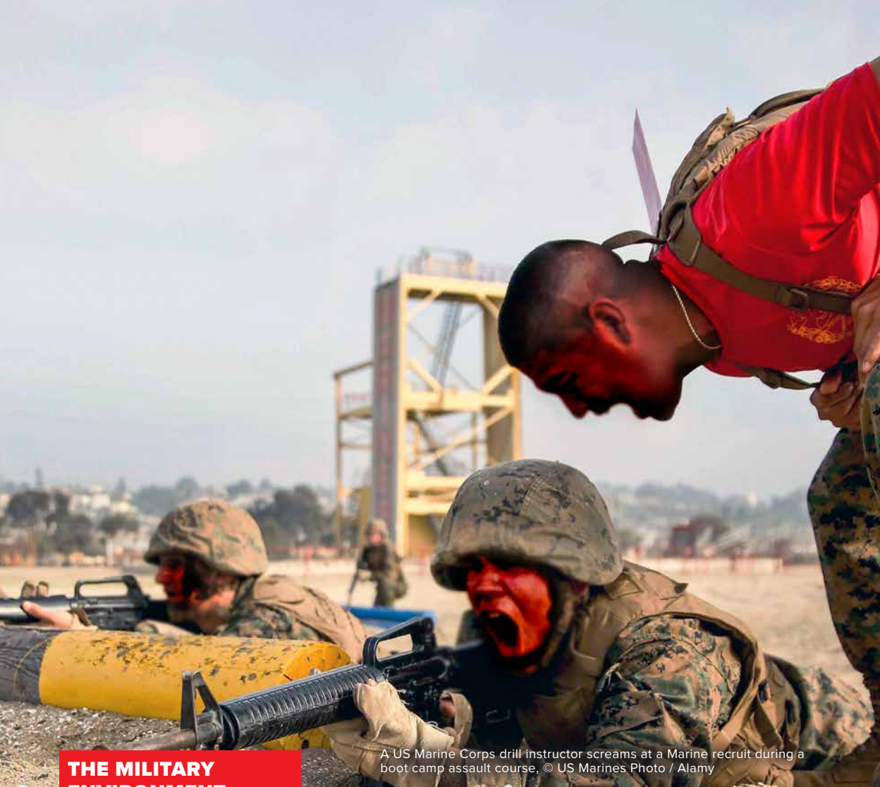
A US Marine Corps drill instructor screams at a Marine recruit during a boot camp assault course