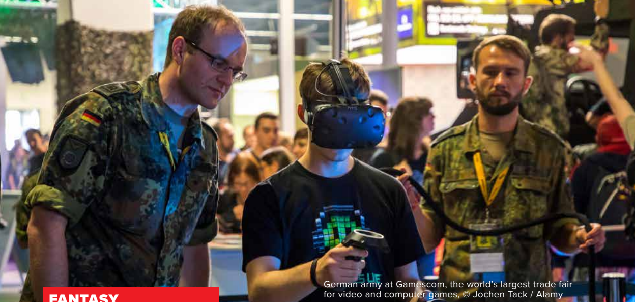
German army at Gamescom, the world's largest trade fair for video and computer games